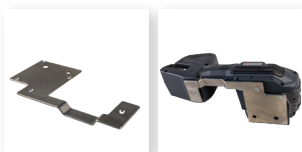
■ Protection plate for usage on abrasive surfaces