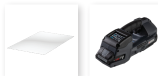
■ Screen protector for additional protection